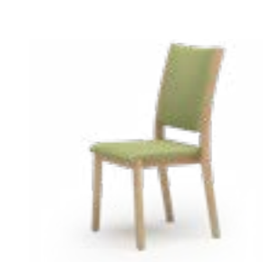
BONNIE 384 HIGH-BACK CHAIR SOLID WOOD FRAME | PLYWOOD, UPHOLSTERY