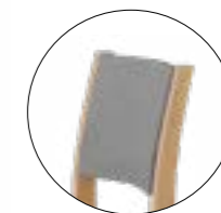
Back 384 Height 810 mm