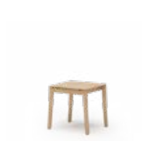
BONNIE 385 STOOL SOLID WOOD FRAME