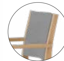
Back 386 Height 870 mm