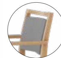
Back 388 Height 870 mm