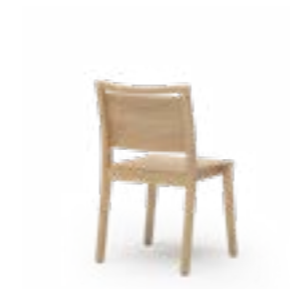
BONNIE 383 STACKING CHAIR SOLID WOOD FRAME | PLYWOOD, UPHOLSTERY