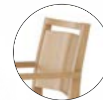
Back 387 Height 870 mm