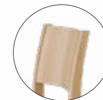
Back 383 Height 810 mm