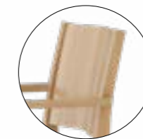
Back 385 Height 870 mm